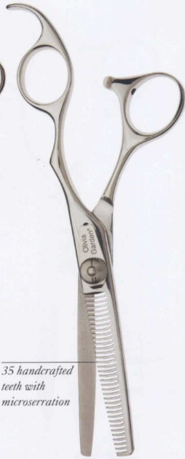
model #: SK-650 (6.50")

35 handcrafted teeth with microserration