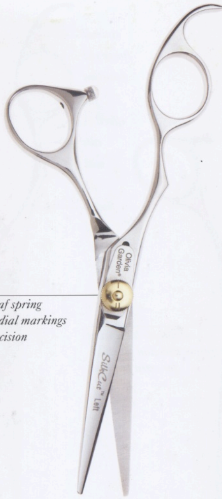
model #: SK-T635LH (6" Left Handed)

adjustable leaf spring tension with dial markings for extra precision